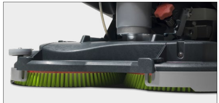
Powerful Twin Brush Cleaning