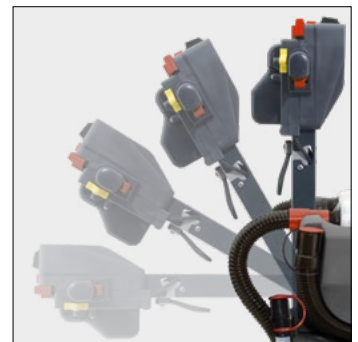
Fully Adjustable Handle