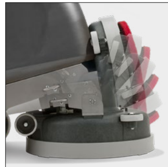
Tilting Brush Deck