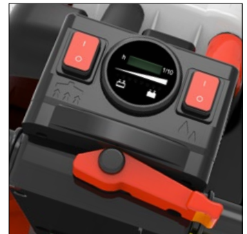
Simple Operator Controls